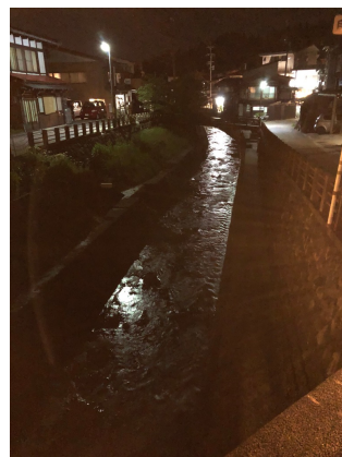
Takayama canal at night