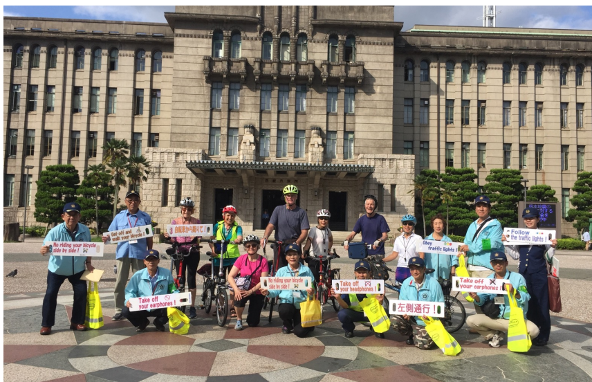
Kyoto City Hall Bike safety week