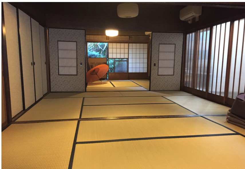
Our guest house in Kyoto Typical machiya house (sadly, no longer operating, but I'll find something comparable!)