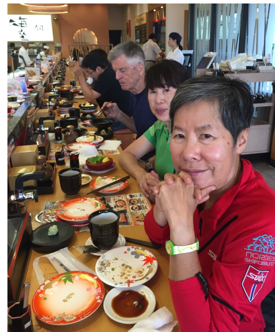
Conveyor belt sushi Wait for it...