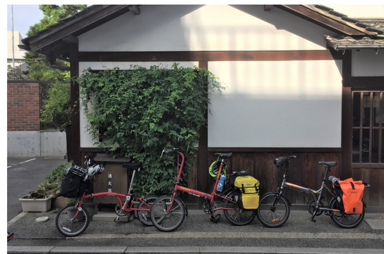
Three bikes: Read to roll!