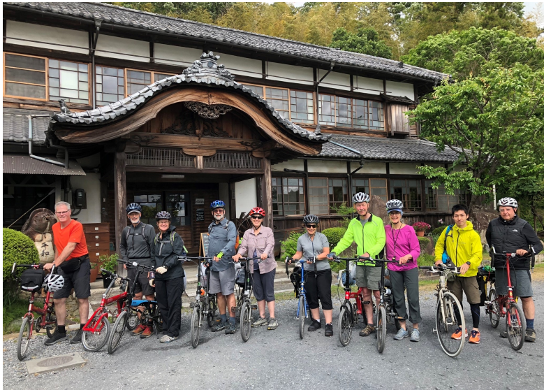
At the Omihachiman Youth Hostel, near Lake Biwa, Shiga Formerly a chamber of commerce building, repurposed about 50 years ago as a youth hostel.

From Kyoto, we boarded a local train to the southern tip of Lake Biwa, Japan's largest lake, and cycled to Omihachiman