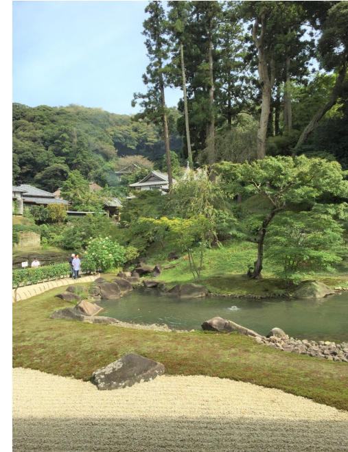
Garden with “borrowed scenery” ( shakkei )