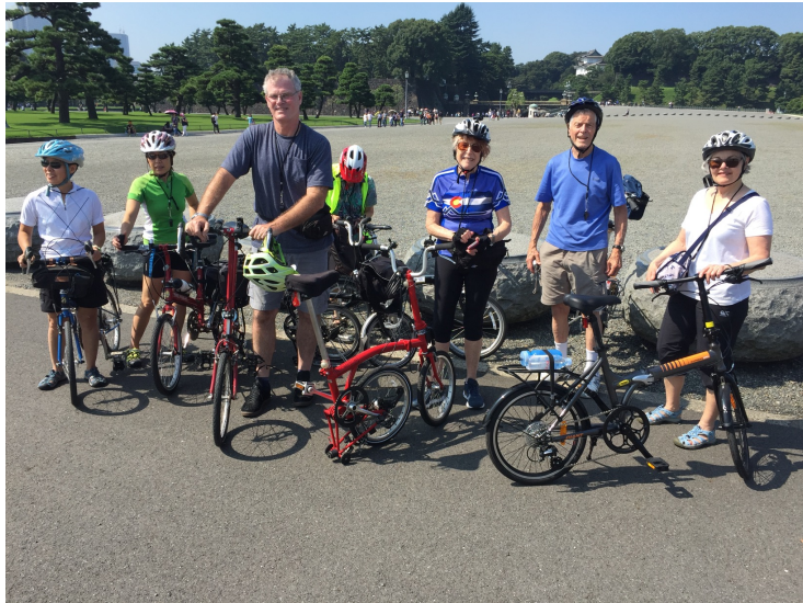
Setting out in Tokyo (6-member group + guide)