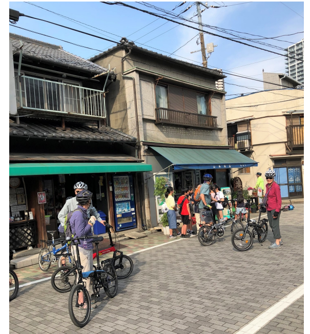
Old Tokyo: Tsukishima street scene