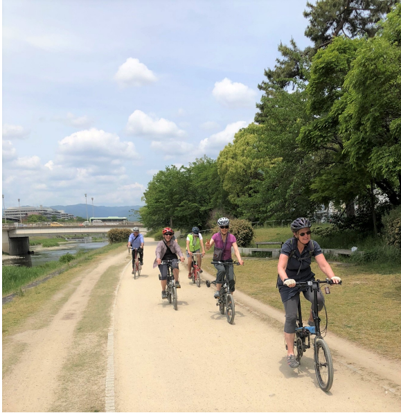
Cycling along the Kamo River in Kyoto. One of the great urban bicycle routes.

From Kyoto, we boarded a local train to the southern tip of Lake Biwa, Japan's largest lake, and cycled to Omihachiman