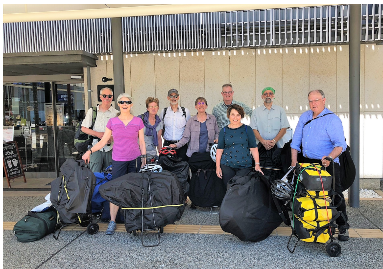
Heading back to Tokyo at the end of our 2-week sojourn