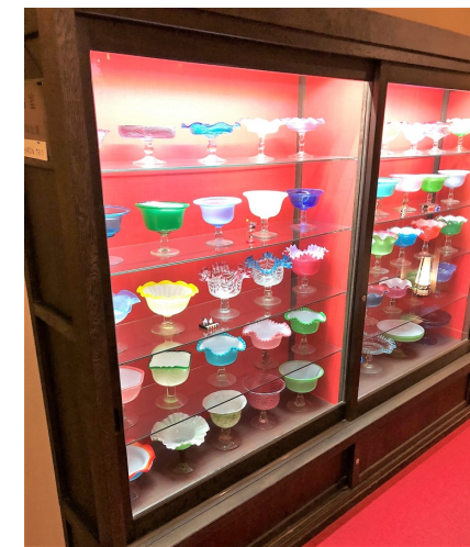
The inn at Takayama. Amazing glass collection. Showcases lining the corridors.