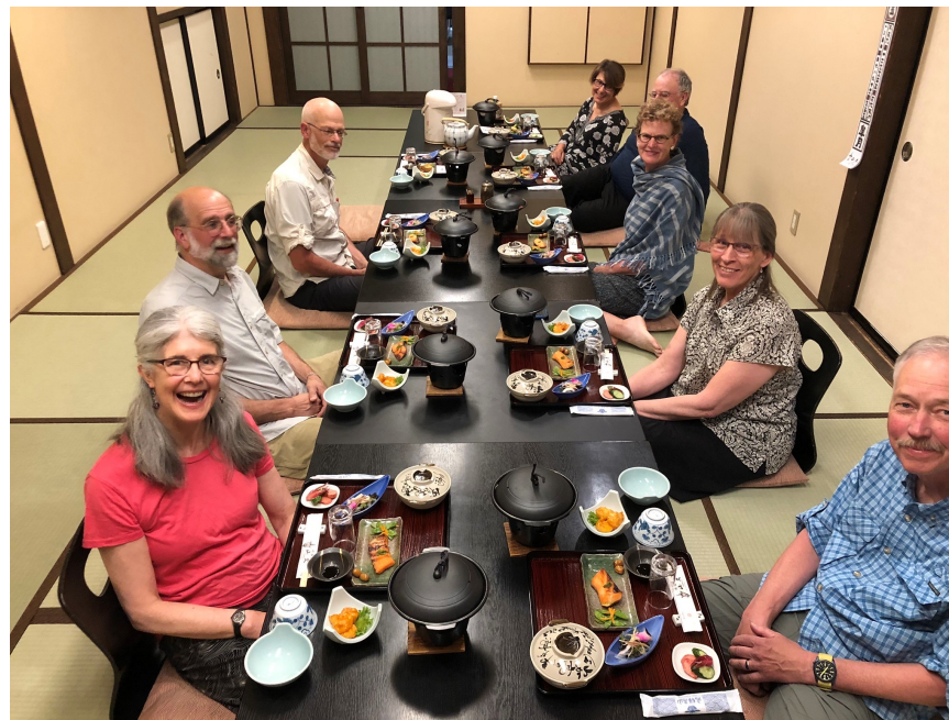
Last breakfast together in Takayama, Gifu Prefecture. The food and ambiance here were extraordinary!