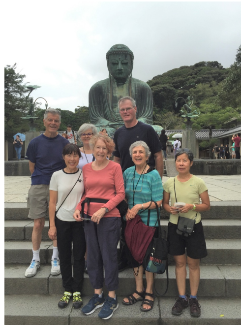
Great Buddha (Kotoku-in) in Kamakura

This was a 6-person group, with members from Amherst, MA, New York City, Toronto, Calgary, and New Zealand