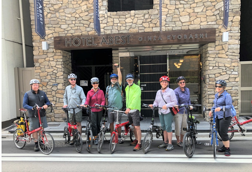
Ready to set out on exploration of Tokyo