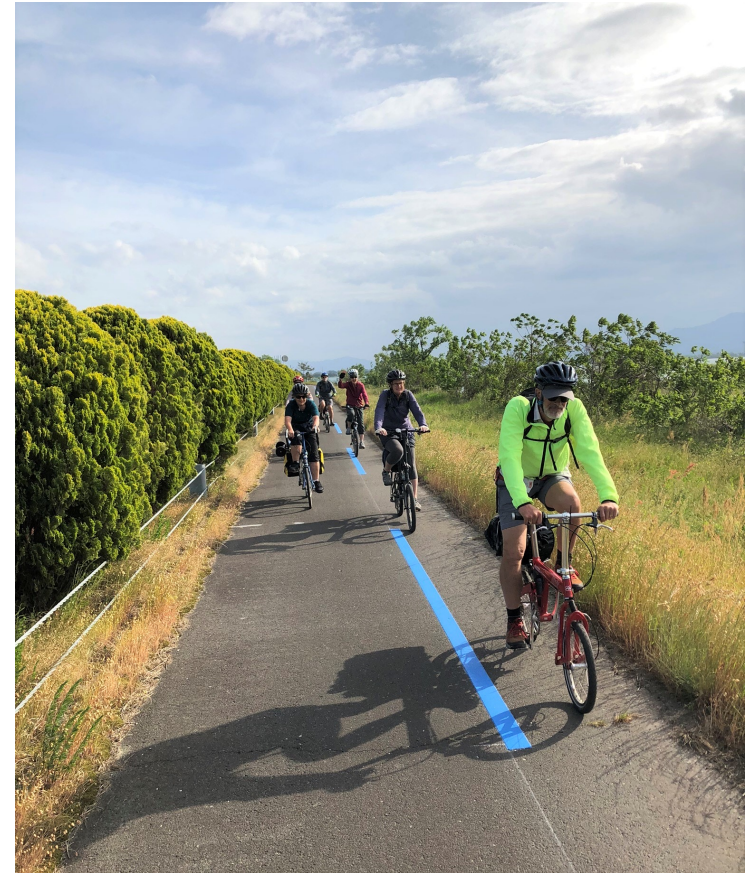
Cycling along Lake Biwa, Japan's largest lake A beautiful day, but strong winds!