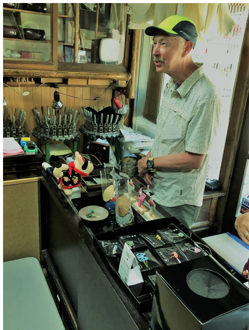
Our musicologist member finds a traditional instrument shop in Kanazawa and tries out a shamisen